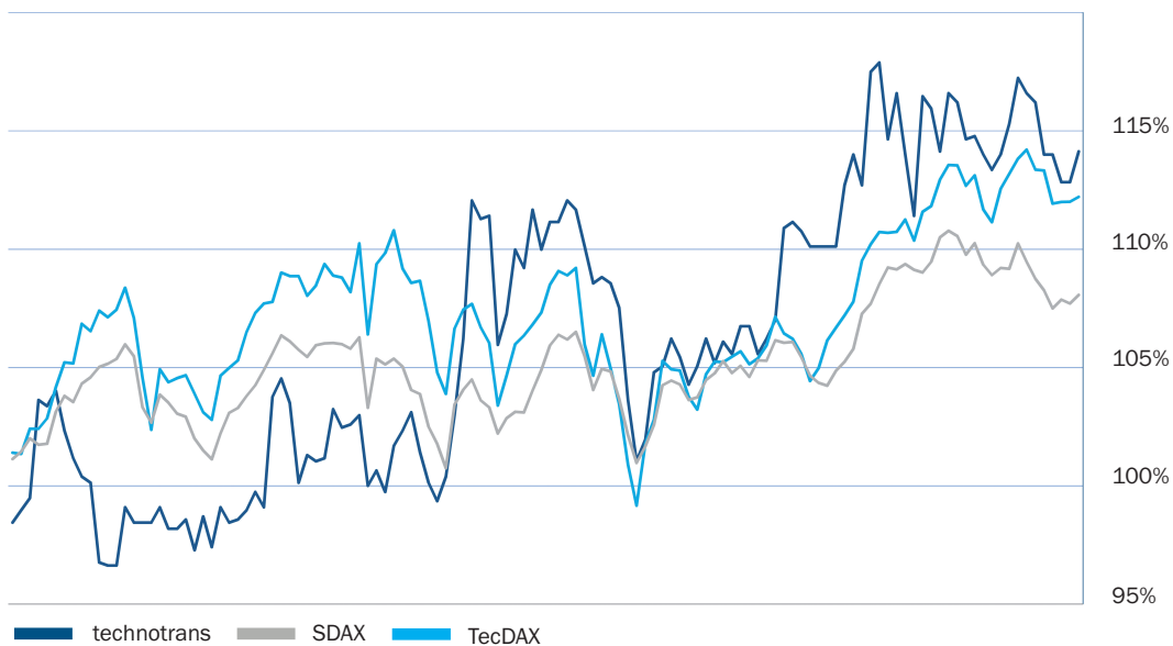
Chart development from 1/1/ to 30/6/2014

technotrans shares again performed well over the first six months when measured against the SDAX and TecDAX. At June 30, 2014 the shares had appreciated by 14 percent and were thus substantially up on the closing price for 2013. At present the analysts' price targets range between € 9.80 and € 13.00, and without exception represent "buy" recommendations. To date, the shares' year-high of € 9.10 was reached on May 28.